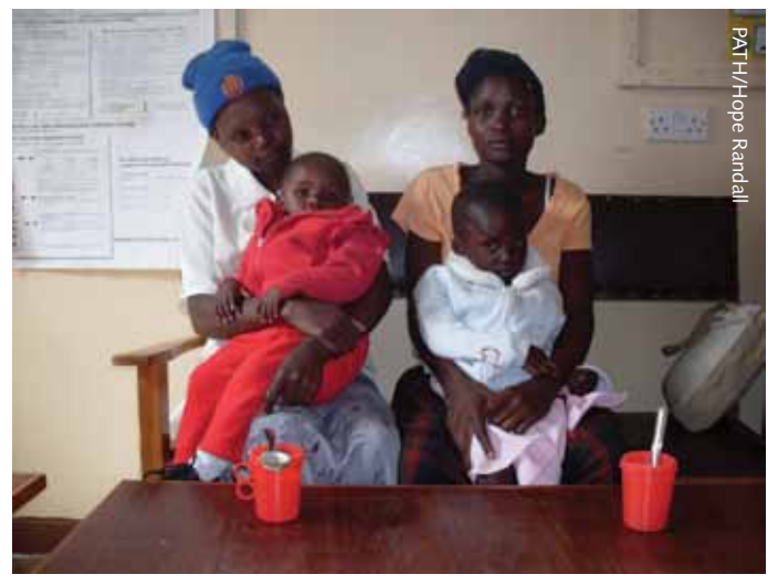
These children at the ORT corner at Kakamega Hospital will be dismissed in a matter of hours.

Thanks to the ORT corner and to basic prevention and treatment education, the ward now sees far fewer cases of diarrhoea per day - sometimes none at all.