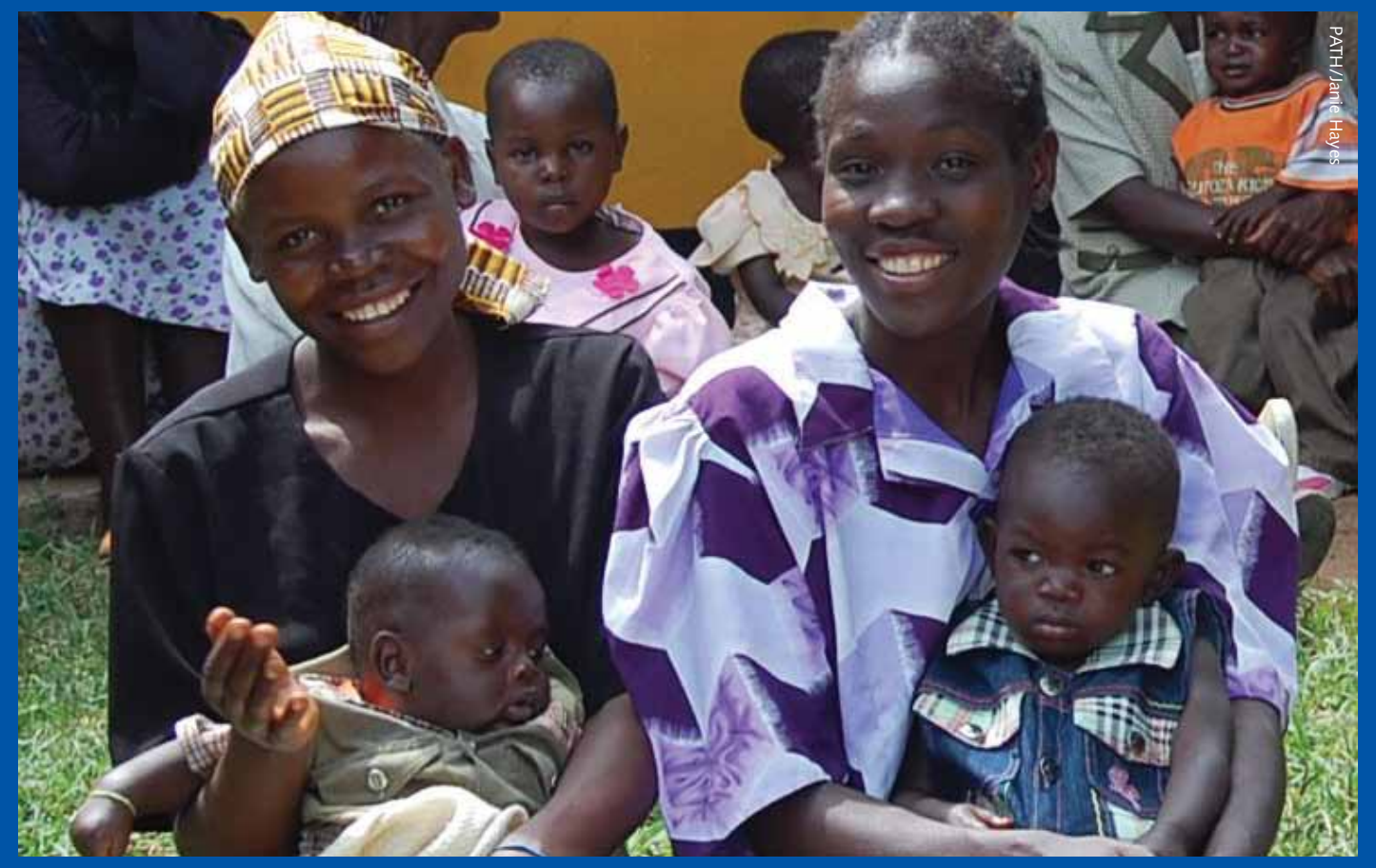
Mothers wait to have their children seen at Webuye Health Clinic in Kenya's Western Province.

Keeping the promise: united to achieve the Millennium Development Goals, UNGA resolution, 17 September 2010<sup>1</sup>